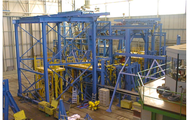
Test-rig during adjustment of the superstructure (closed test-rig)