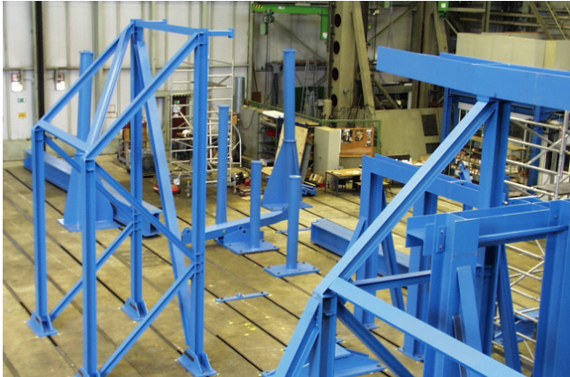
Beginning of assembly of the test-rig