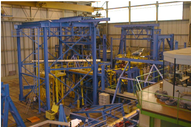
Test-rig with both outer wings in position