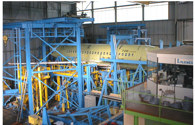
Test-rig with fuselage in position