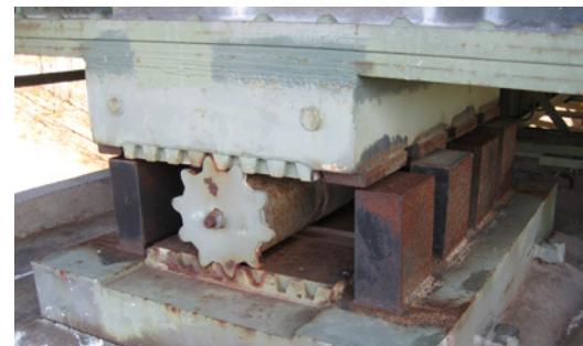
Before: An old roller bearing before removal. Graphics: Maurer Söhne